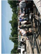
UMRCC veg Sampling 2009