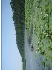
Lower Pool 11