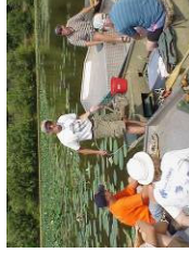
UMRCC Teachers workshop