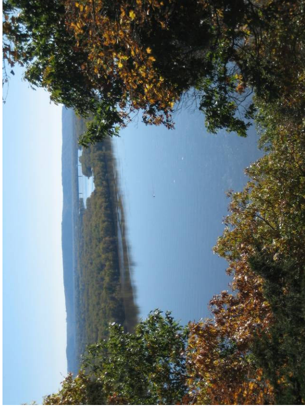
Pool 10 from Effigy Mounds