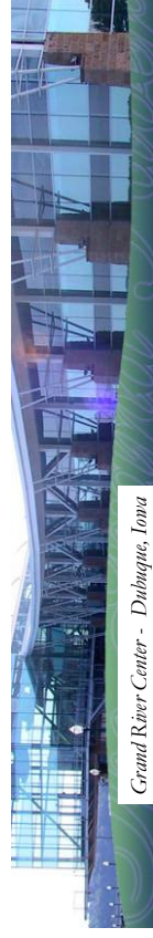
Grand River Center - Dubuque, Iowa